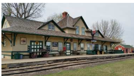
Big Valley Train Station

On May 13, PAMZ held its Annual Issues identification Meeting in the Town of Big Valley to obtain public input on air quality issues it should be addressing and to help PAMZ determine the locations where it will conduct air quality monitoring with its portable station in 2016.