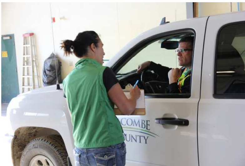
Vehicle Emissions testing at Lacombe County