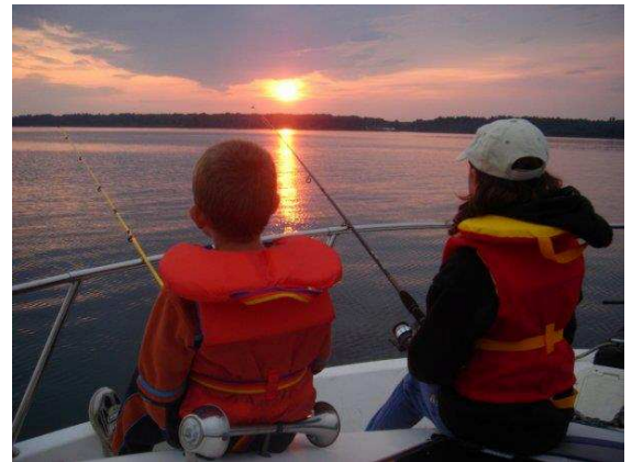
Fishing at Sunset

For more details about the contest, go to the PAMZ website at www.pamz.org .